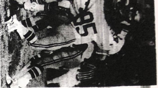
The Stop Valdosta ball carrier.